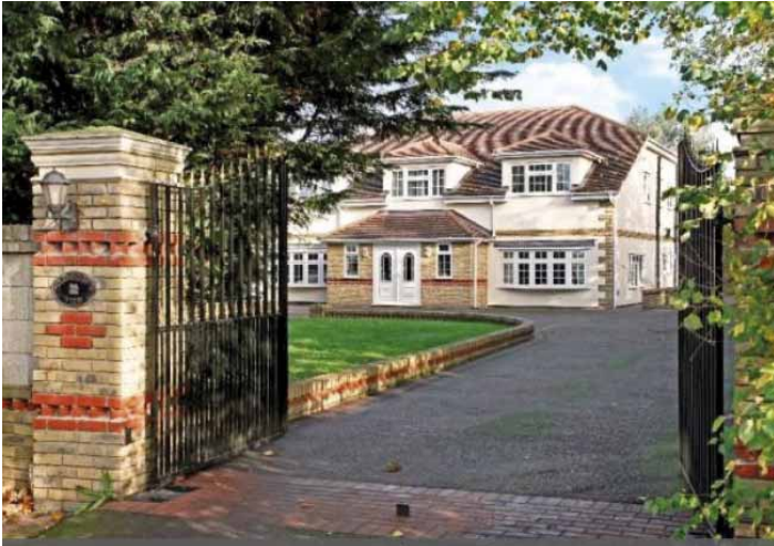
Property in Kent granted planning permission in 1996.